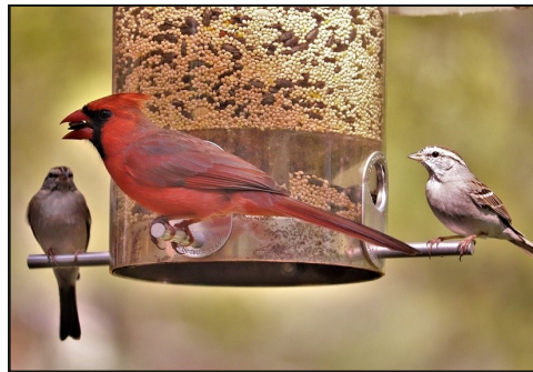
Northern Cardinal and Chipping Sparrows on Feeder

Notes: Feeders should be cleaned regularly with hot water and detergent. All wet or moldy food should be removed, as it can poison birds. Sugar solutions should be replaced every three to five days.