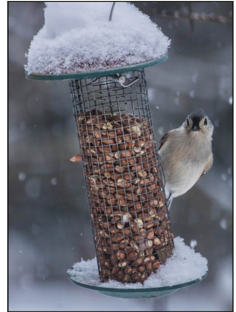
Tufted Titmouse on Feeder