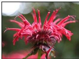
Bee Balm (Monarda)

However, the greatest advantage for drawing birds to your yard can be influenced by your plantings. Hummingbirds are drawn to red plants like Bee Balm. Thistle, Black-eyed Susans, and Sunflowers will draw finches. But since most feeding occurs in winter, think about plants that offer resources throughout this period, such as Winterberry or Chokeberry. The berries of these plants are not high in sugar, and so they are not initially picked, nor do they rot quickly. Also, consider evergreen trees with their cone crops. Most nurseries can help you with your selection of plant material. Please consider purchasing only native plants, which are the most beneficial to our wildlife.