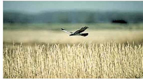
(Northern Harrier flying over field)

The fields of Cold Brook offer a wonderful opportunity to view and find evidence of some of the County's predators. Scan the skies to see if any raptors are hunting in the area. Red Tailed Hawks are common and Northern Harriers have been known to reside here during the winter season. While walking the trails, look for scat and tracks of coyotes and foxes .