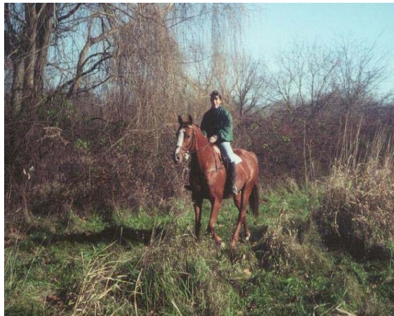
(Horse and Rider on Trail)

Cold Brook offers many forms of recreational activities. Visitors can hike over two miles of easy trails. The trail takes advantage of existing farm roads. Horseback riding, cross-country skiing, and mountain biking are permitted on the trail system. Visitors are exposed to a variety of habitats along the trail which include meadows, wooded areas, and the edge habitat between them.