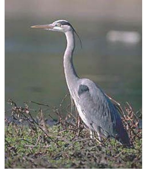
(Great Blue Heron)