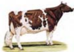
Red & White