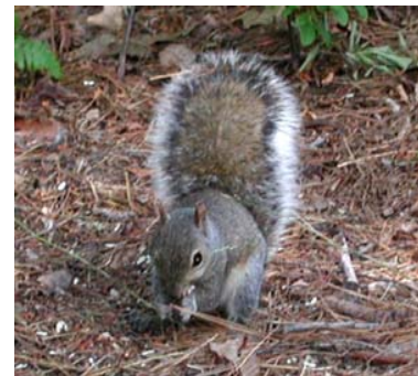
(Eastern Gray Squirrel)

Ridge/Highland Trail: The Ridge Trail departs from the right side of the parking lot and is a moderate to difficult trail. The trail runs along the ridge of the mountain. After passing through the ravine, the trail is called the Highlands Trail. The Highlands Trail System is a cooperative effort of the New York/New Jersey Trail Conference. Their goal is to create a trail system to span the highlands between Hunterdon and Passaic Counties.