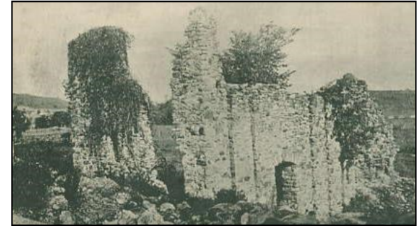
The remains of the old Union Furnace as it appeared in the early 1900s.