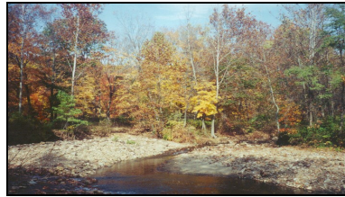
Spruce Run Inlet

Take exit 16 (Washington Exit) to Route 31 north and travel 6.6 miles to Van Syckles Road. Proceed as above.