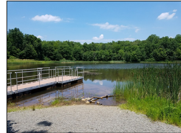
Large pond with accessible fishing pier