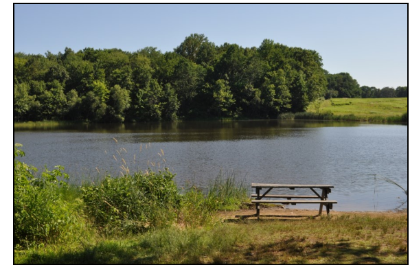
Large pond with picnic table