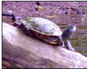
Eastern Painted Turtle

Today, the South Branch Reservation encompasses over a thousand acres and helps preserve the watershed of the South Branch of the Raritan River. The reservation preserves wildlife habitat and provides recreational opportunities.