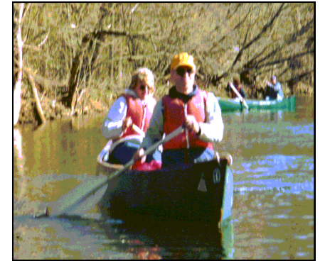
Canoeists on South Branch River