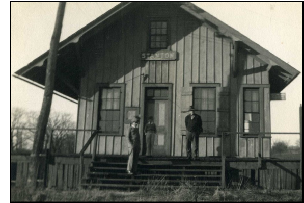
Stanton Station, circa 1900