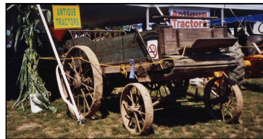
Antique Farm Equipment at the 4-H Fair

From the Lambertville Area: Take Route 179 north toward Ringoes. After about 5 miles you will see the park entrance on the left.