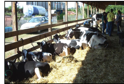
Cows at the 4-H Fair

Most of the structures and field areas of the South County Park can be reserved for special activities. For information, availability, or general inquiries about events at the South County Park, contact the park office at (908) 782-1158.