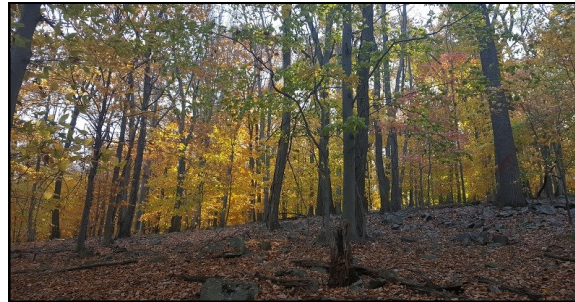
Fall color along the Blue Trail

Take Route 31 south about 5.5 miles from Interstate 78. Use the jug handle for Route 618 (Stanton Grange Road) and proceed to the end of this road. Turn right onto Route 629 and drive about 3/4 mile. Turn right onto Foothill Road. The entrance to the parking area will be to the left.