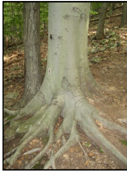
Trunk and roots of a beech tree found along the Point Mountain North trails.

Directions from the Clinton Area: Take Route 31 North past Glen Gardner and Hampton until the junction with Warren County Route 632, across from the A&P. Turn right onto 632/Asbury-Anderson Road. At the end of 632, turn right onto Route 57. Proceed 1.7 miles and turn right onto Old Turnpike Road. Cross a stone bridge and pass a farm; the gravel parking area will be on the right.