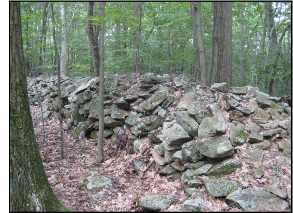
Rock wall, a reminder of an earlier time