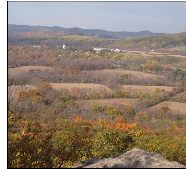
View from overlook