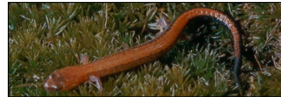
Red-backed Salamander—red phase

Hunting is permitted to control the deer population. Hunters must obtain a special permit issued by the Division to be able to hunt on the park. Visitors between September and February are strongly encouraged to wear blaze orange or confine visits to Sundays.