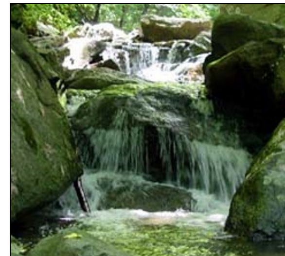
Waterfall at Scout Run