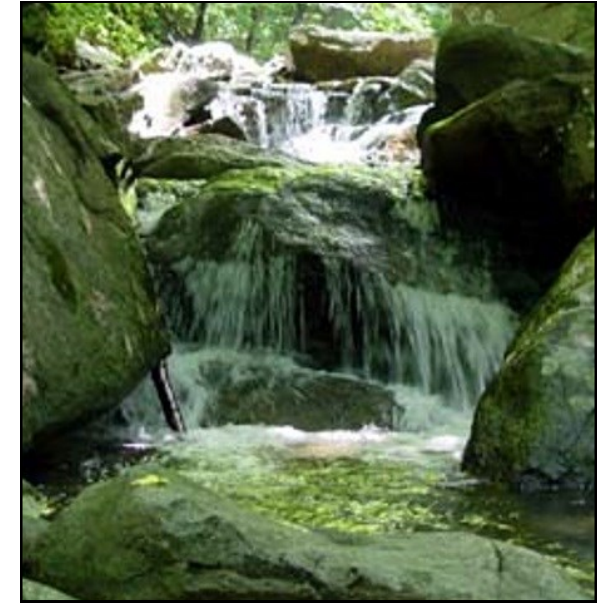
Waterfall at Scout Creek