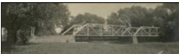
Old bridge.

The South Branch Reservation totals over 1000 acres. Besides providing recreational opportunities, the reservation helps preserve the South Branch of the Raritan River Watershed and provides wildlife habitat.