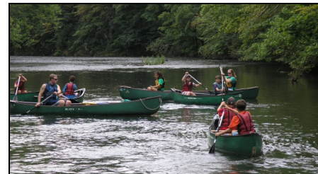
Canoe trip on the South Branch River

The area just beyond the parking lot could be used as river access for canoes. Canoeing the South Branch of the Raritan River is a wonderful way to view wildlife. The river corridor provides an excellent habitat for waterfowl, which can be viewed all along the river. Aquatic reptiles, such as Painted Turtles, are regularly observed perched on the stone and tree outcroppings along the banks of the river.