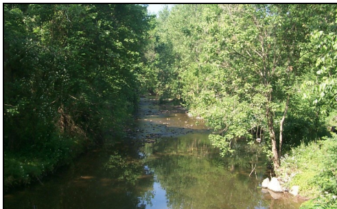
South Branch of the Raritan River

The Landsdown Trail adjoins the South Branch of the Raritan River. Over 1000 acres of parkland exist along this river, and these pieces collectively are called the South Branch Reservation. This reservation provides recreational opportunities, helps preserve the watershed from development, and provides wildlife habitat. Visit the county park website for trail maps and guides for these