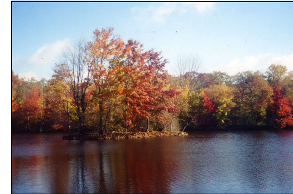
Manny's Pond in autumn