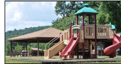
Cedars Pavilion and playground

The Cedars and Overlook Pavilions are reservable for groups of 25 or more people. Both are located near parking areas and include running water and electric onsite. Possession or consumption of alcoholic beverages is not permitted, except by special permit at the Cedars Pavilion.