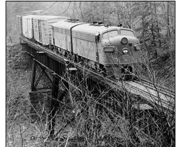
Train on the old line.