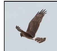
Northern Harrier.

Old debris and wood piles, which are scattered about in the old fence rows and tree lines, provide excellent habitat for snakes. Potential sightings include Black Rat Snakes and Eastern Milk Snakes.