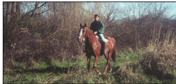
Horse and rider on trail.

Cold Brook offers many forms of recreational activities. Visitors can hike over two miles of easy trails. The trails take advantage of existing farm roads and field edges. Horseback riding, cross-country skiing, and mountain biking are permitted on the trail system. Visitors are exposed to a variety of habitats along the trail which include meadows, wooded areas, edge habitat, and a small drainage pond.