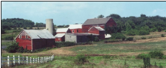
The property when the barns were still standing.